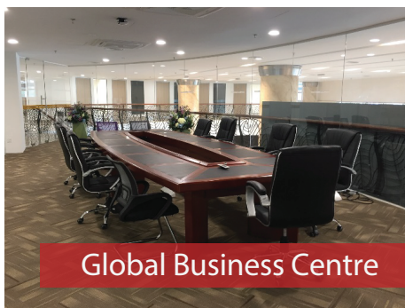
Global Business Centre