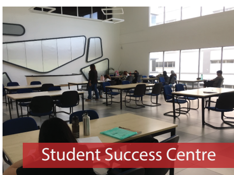
Student Success Centre